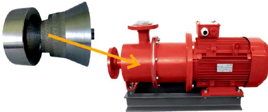
Homogenizer HG 130 with rotor / stator chamber

The Homogenizer operates on the principles of mechanical shearing and ultrasonic forces. It utilizes a special conical shaped milling gear, to generate high hydrodynamic power consisting of shearing, friction and acceleration forces with pressure waves of high frequency. The high molecular asphaltenes are reduced in their size to below 5 \mu\text{m} and homogenized into the heavy fuel oil.