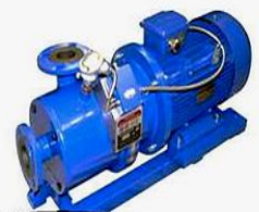
Chinese fake German ship homogenizer